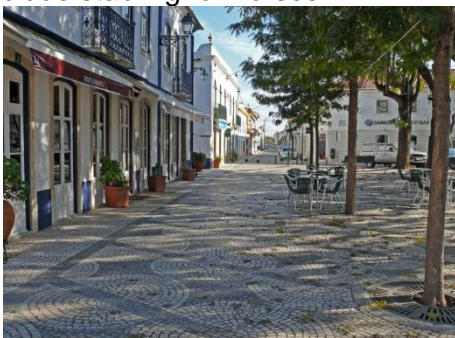
The central square in Golegã