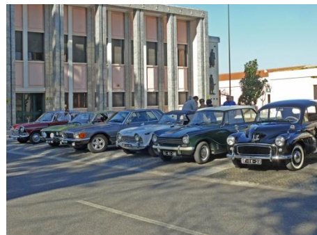
A vintage car rally in front of the Town Hall