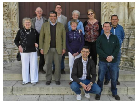
In front of the church with our new friends from Golegã