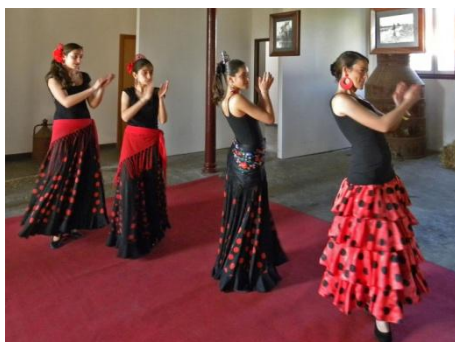
A fine display of traditional dance