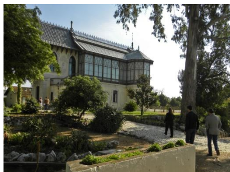
The beautiful studio of the famous 19 th century photographer Carlos Relvas