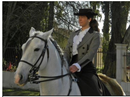
A young equestrian in a display of skill

The culture of Golegã is most famous for the wonderful Lusitanian horses bred in the stud farms of the area. The annual horse fair on the feast of St Martin is the high point of the year and hotels and guest houses in the town are surely unique in that they normally include stabling for horses.